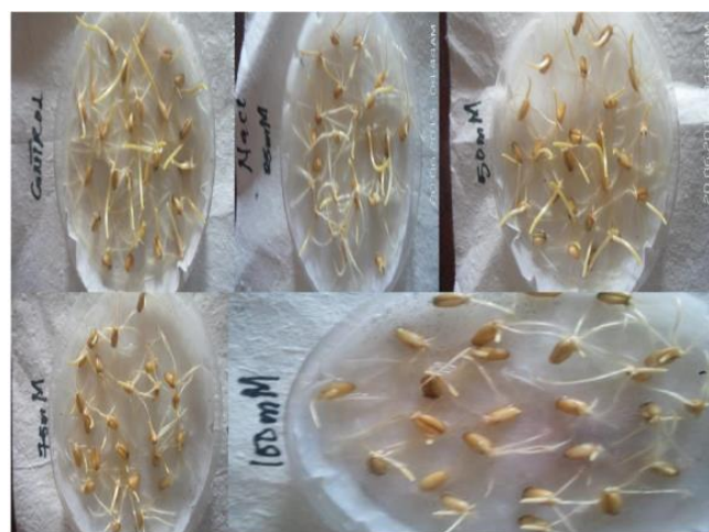
Figure 2: Germinated seeds at various concentrations of NaCl.