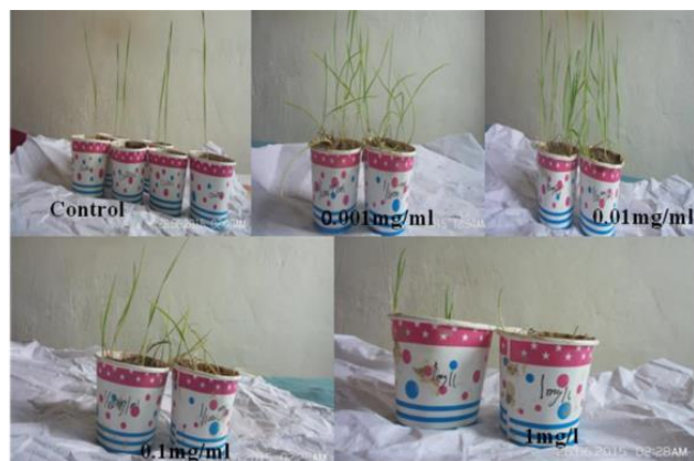
Figure 4: Wheat seedling at various concentrations of HgCl 2 .