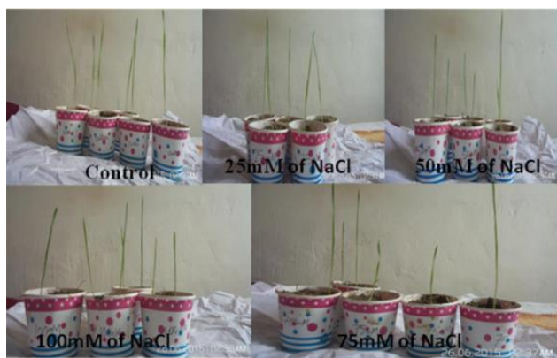
Figure 3: Wheat seedling at various concentrations of NaCl.