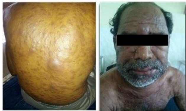
Figure 4: Back, face and chest of patient showing nodular lesions.

Clinically patient presented with diffuse erythema , multiple nodular lesions of varying sizes covering more than 80% BSA (Figure 4).