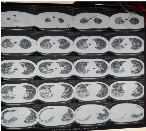
Figure 2: CT chest.

The differentials of lymphoma, end stage sarcoidosis, tuberculosis and fungal infection was kept on the basis of CT Chest. Serum ACE levels were marginally raised. Thereafter an axillary lymph node excision biopsy and HPE was done which suggested lymph Nodes architecture effaced and replaced by mixed population of mixed lymphocytes, histocytes, immunoblast like cells with vesicular nuclei and prominent nucleoli. Infiltration of capsule and pericapsular tissue by tumour cells, on the basis of which a diagnosis of Non Hodgkin Lymphoma was kept. Histopathology slide as follows (Figure 3).