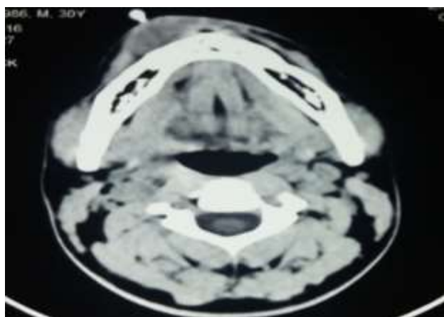
Figure 2: CT revealed a fairly well defined lesion in the sublabial region with multiple tiny vascular channels with no obvious calcification or haemorrhage.