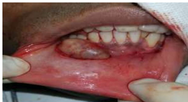
Figure 3: Intraoperative picture depicting intraoral excision.

tongue. Tumour can be less likely in the palate, floor of the mouth, gingiva, buccal mucosa and parotid gland as well. 2 Lower lip is an extremely rare site with only a few similar cases reported in the literature. 3