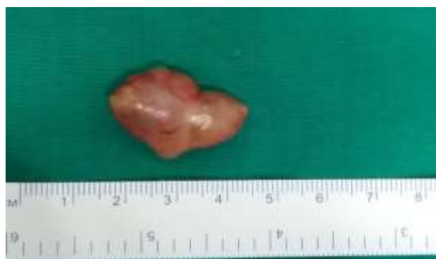
Figure 4: Complete excision of mass.