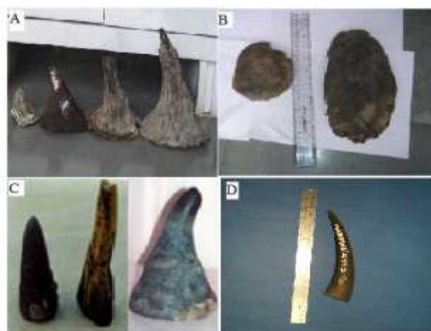
Figure 1: Samples used in the study (A. Rhinoceros horns from wild; B. from zoo; C. Fake rhinoceros horns and D. Buffalo horn).

Total nine horns (three rhinoceros horns from wild, two from zoo, three fake rhinoceros horns and one buffalo horn from wild) were examined under scanning electron microscope as shown in Figure 1.