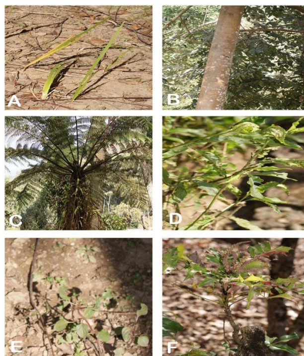
Figure 1: A= Acorus calamus ; B= Cinnamomum tamala ; C= Cyathea spinulosa ; D= Justicia adhatoda ; E= Mentha arvensis ; F= Mahonia napaulensis .

Medicinal uses: Bark and berries are stomachic, fever, and cough, dysentery.