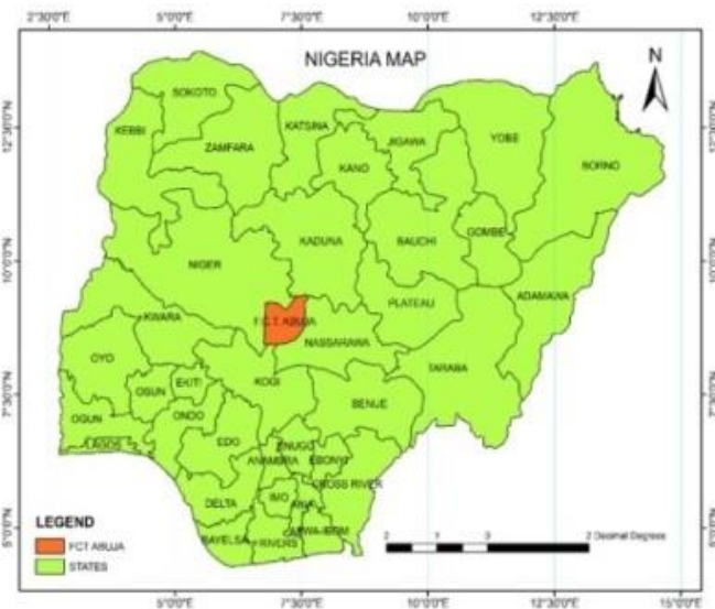
Figure 1: Map of the Nigerian states and FCT Abuja